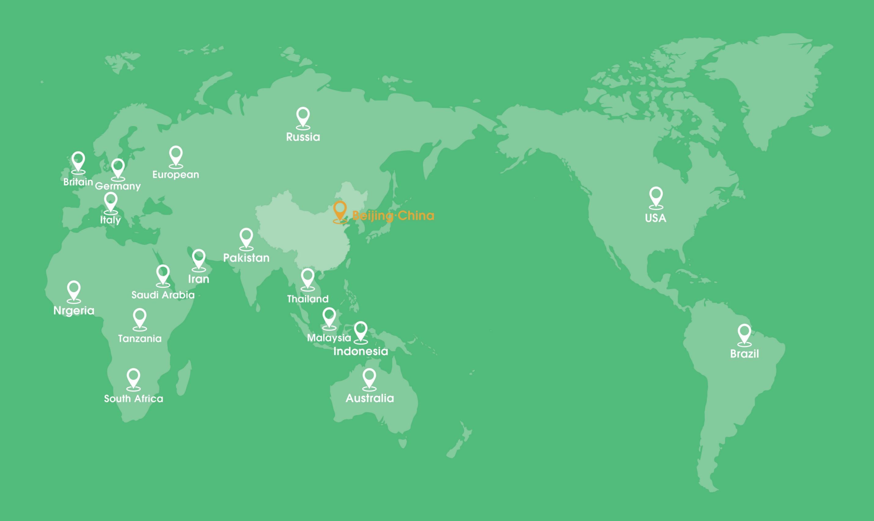
Pro-med (Beijing) Technology Co., Ltd